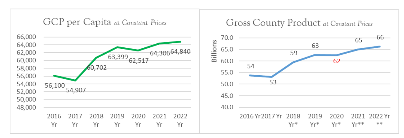
Figure 2; Makueni GCP & GCP per capita Projections at Constant Prices

In 2021 and 2022, the county economy is expected to accelerate rate due to reduced business risk and uncertainties resulting from the full re-opening of the economy. Revamping and boosting agricultural production and value addition through government and private investment will accelerate economic growth despite the depressed rainfall amounts witnessed in the lower parts of the County. Moreover, funding MSMEs will boost growth in; accommodation and food sector; transport and storage sector as well as the wholesale and retail trade.