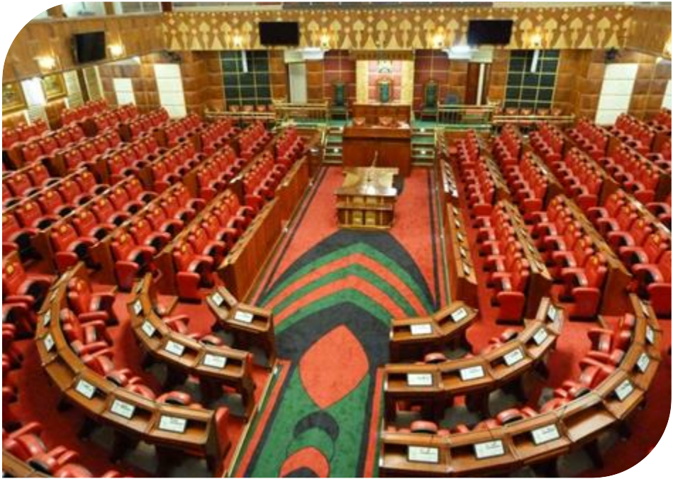
The National Assembly