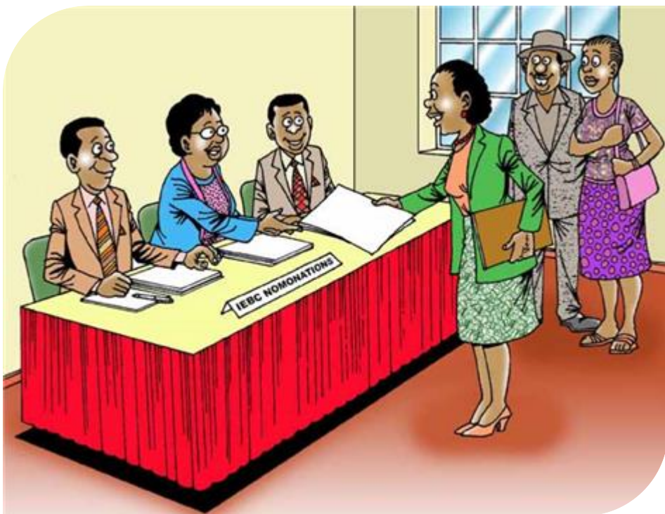
Figure 5 : Officers verifying nomination requirements

There are different requirements for one to qualify to be elected in any of the six elective positions.