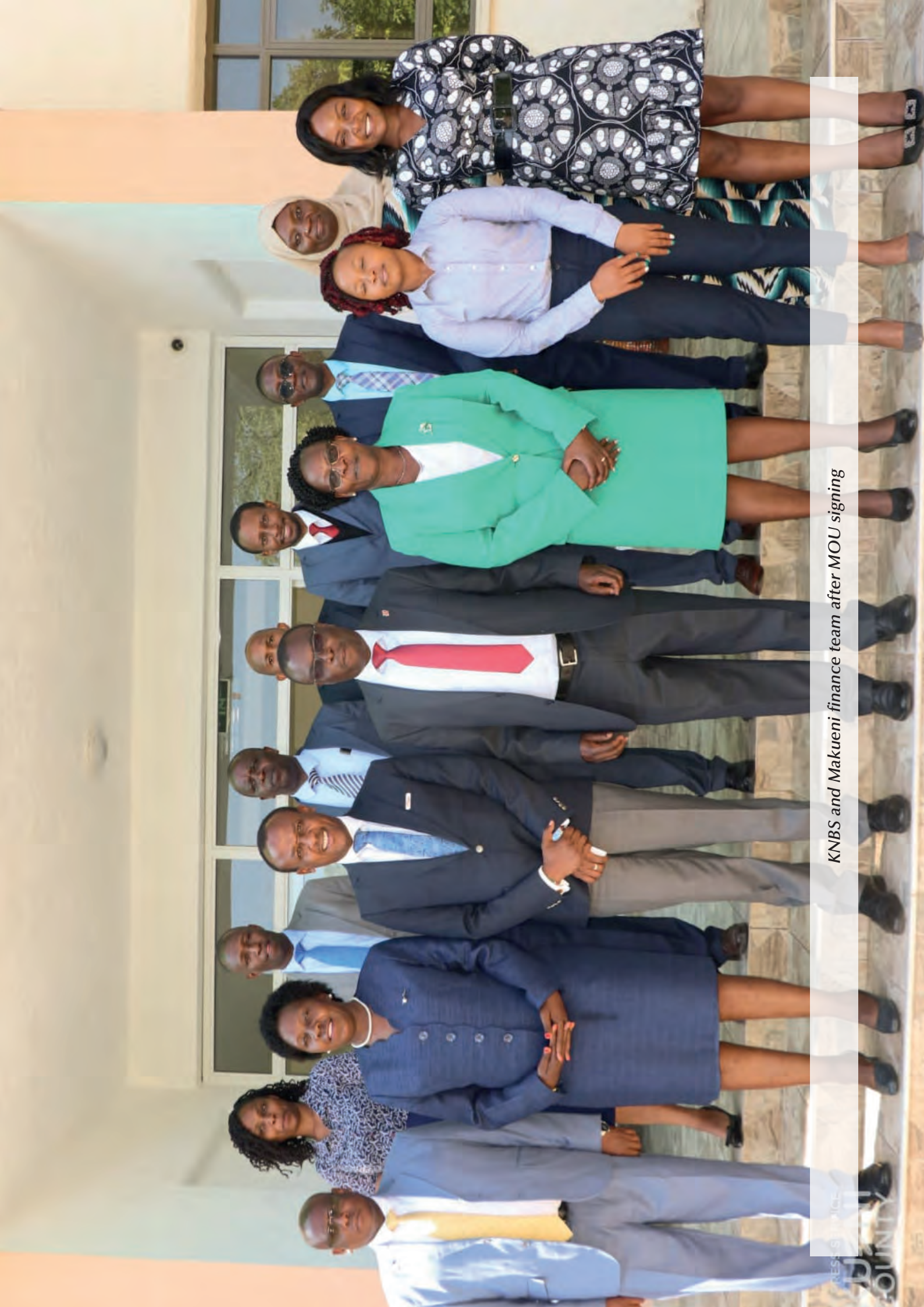
KNBS and Makueni finance team after MOU signing