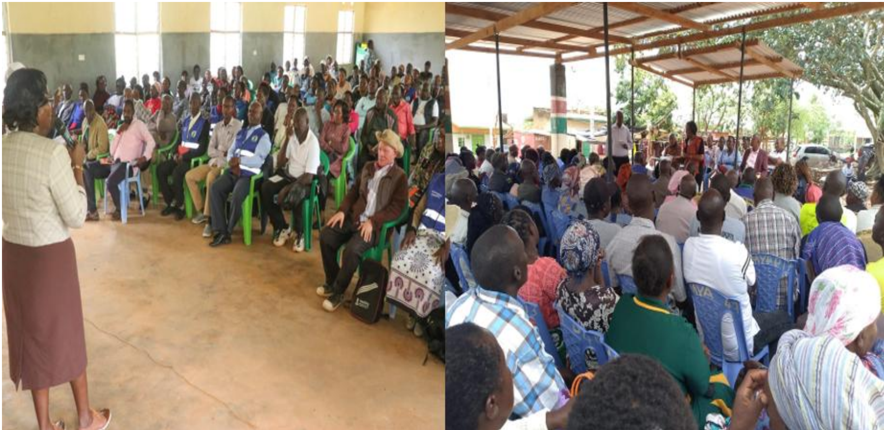
Figure 5: CECM Finance and CECM Agriculture at Kisau/Kiteta and Mavindini Wards PP respectively