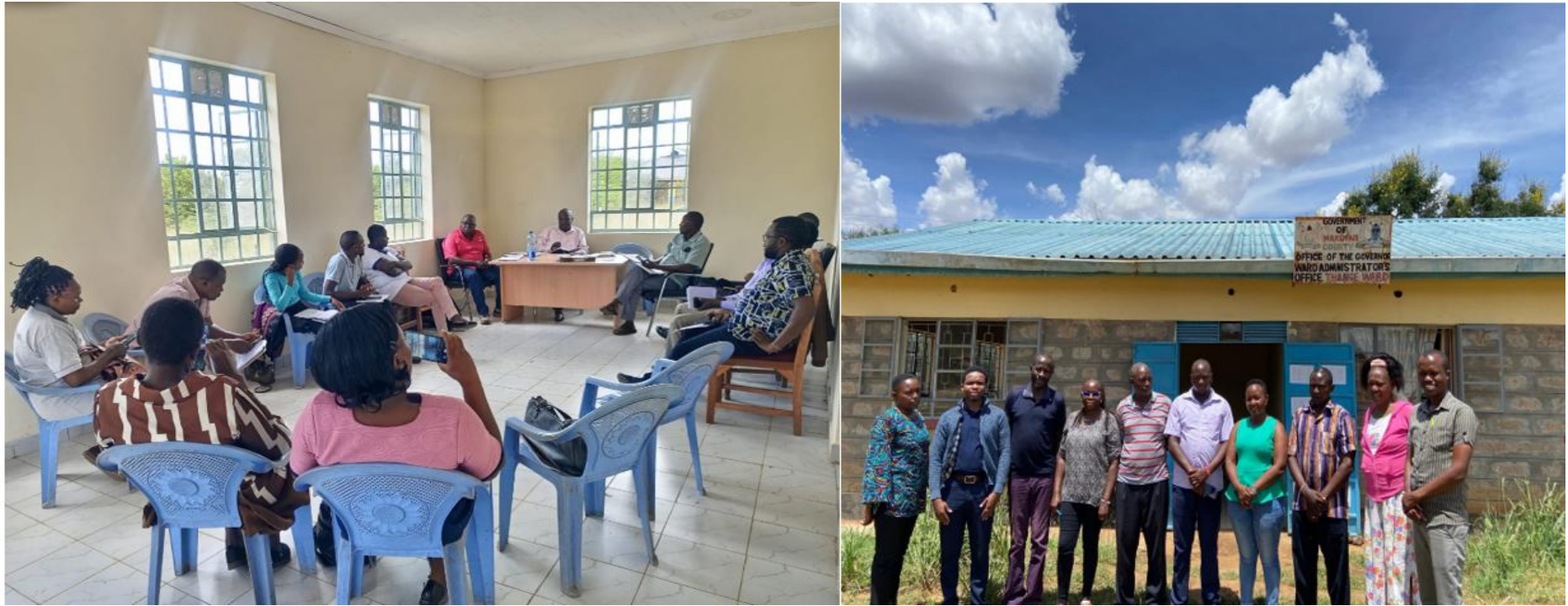
Figure 2: Ward HoDs sensitization meeting on PB process at Ivingoni/Nzambani and Thange wards