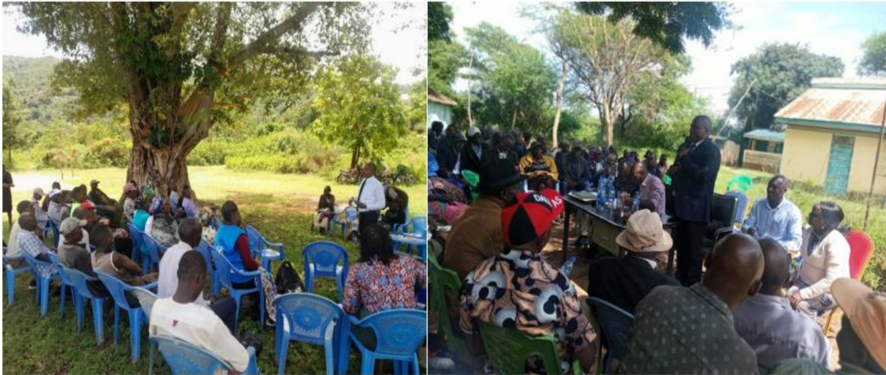
Figure 6: County Attorney and CECM Devolution guiding communities during PB Forums