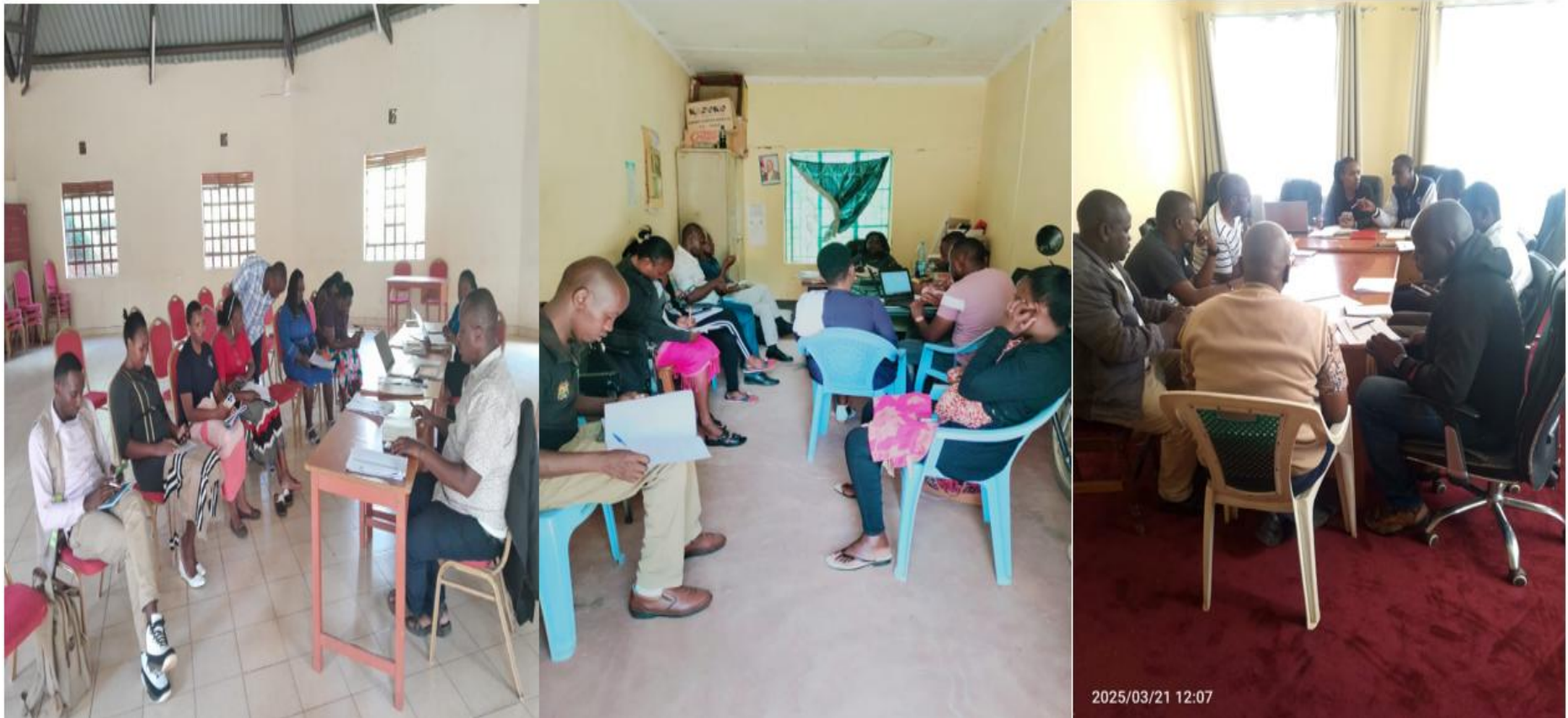
FIGURE 3: Ward HoDs technical backstopping meetings at Wote/Nziu, Kasikeu & Kiima Kiu/Kalanzoni wards