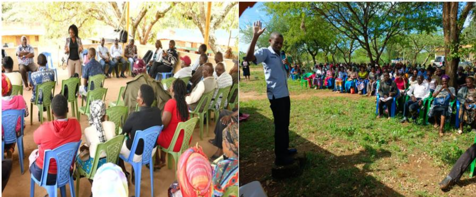
Figure 7: Chief Officers Education and Planning & Budgeting at Kitaingo Central Cluster and Nguu/Masumba respectively