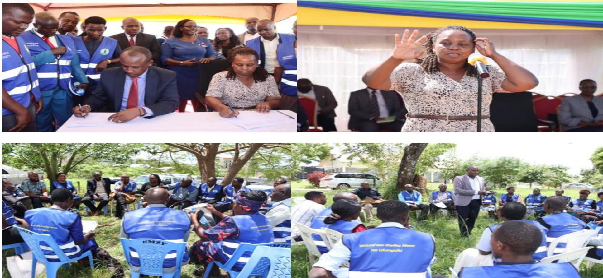
Figure 8: County project Validation Forum presided over by H.E the Governor at MIVEC grounds.