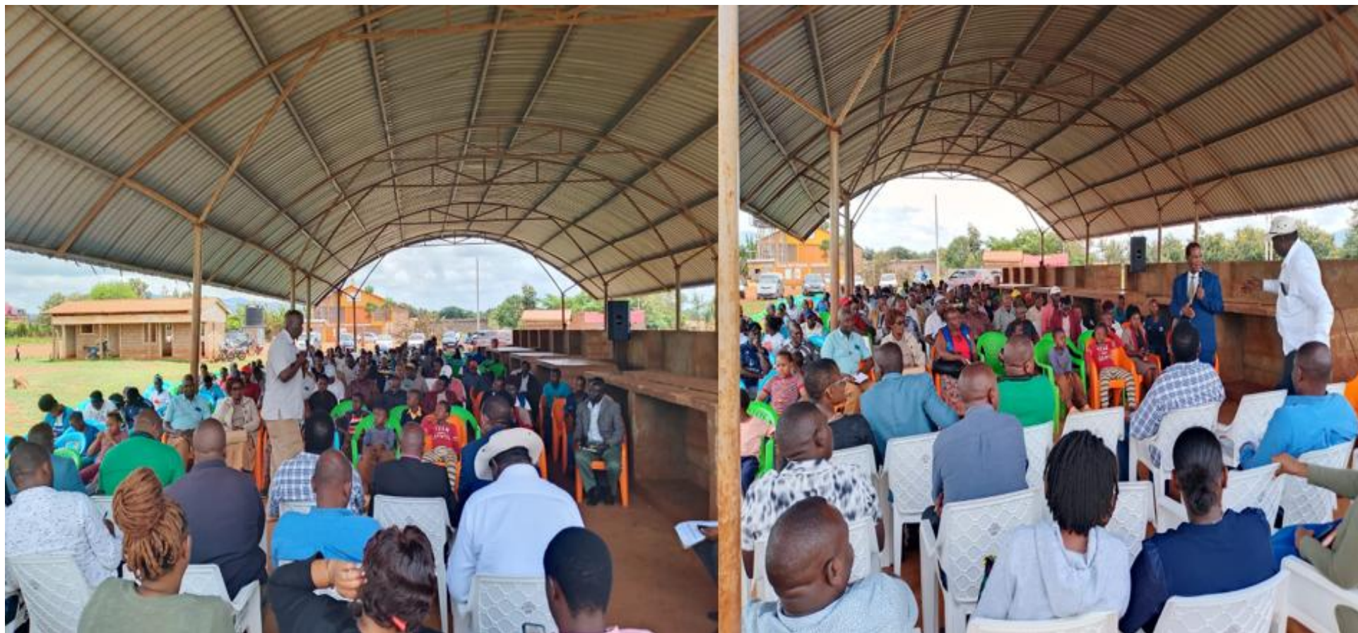
Figure 4: MCA Kasikeu ward and Government Advisor during Emali-Sultan Hamud Municipality