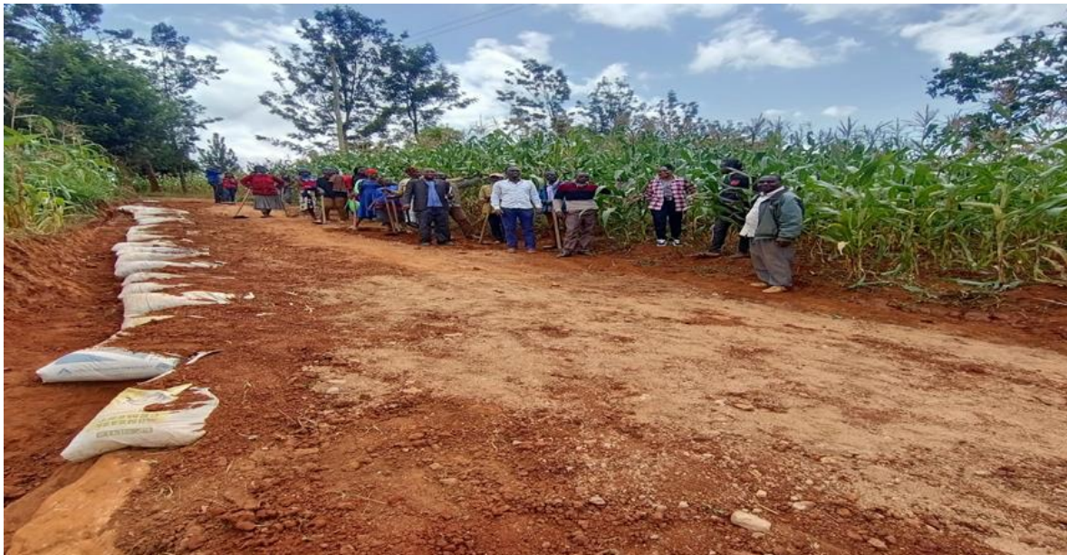
Figure 6: MKJ programme - Manual Light grading at Ilima Ward