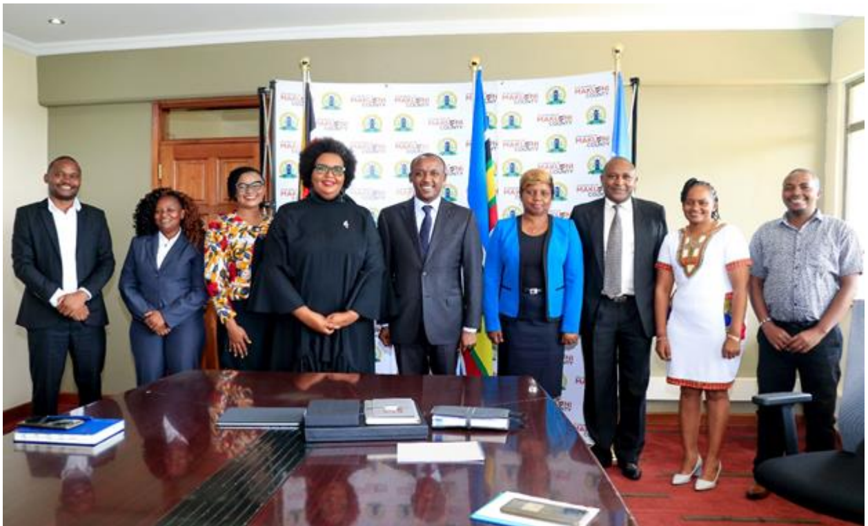
Figure 11: Non state actor engagement meeting between AVF and H.E Governor on 4th March, 2023