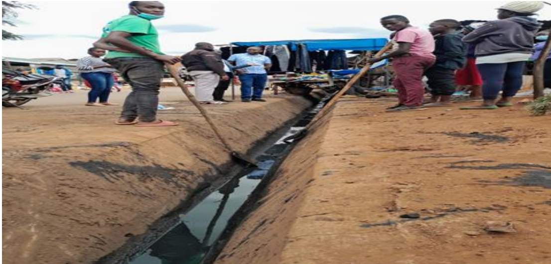
Figure 5: MKJ program casuals unblocking Emali Sewer line