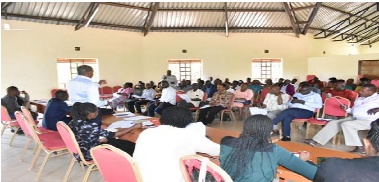
Figure 4: FY 2023/24 Ward Budget Participation Forum, Wote