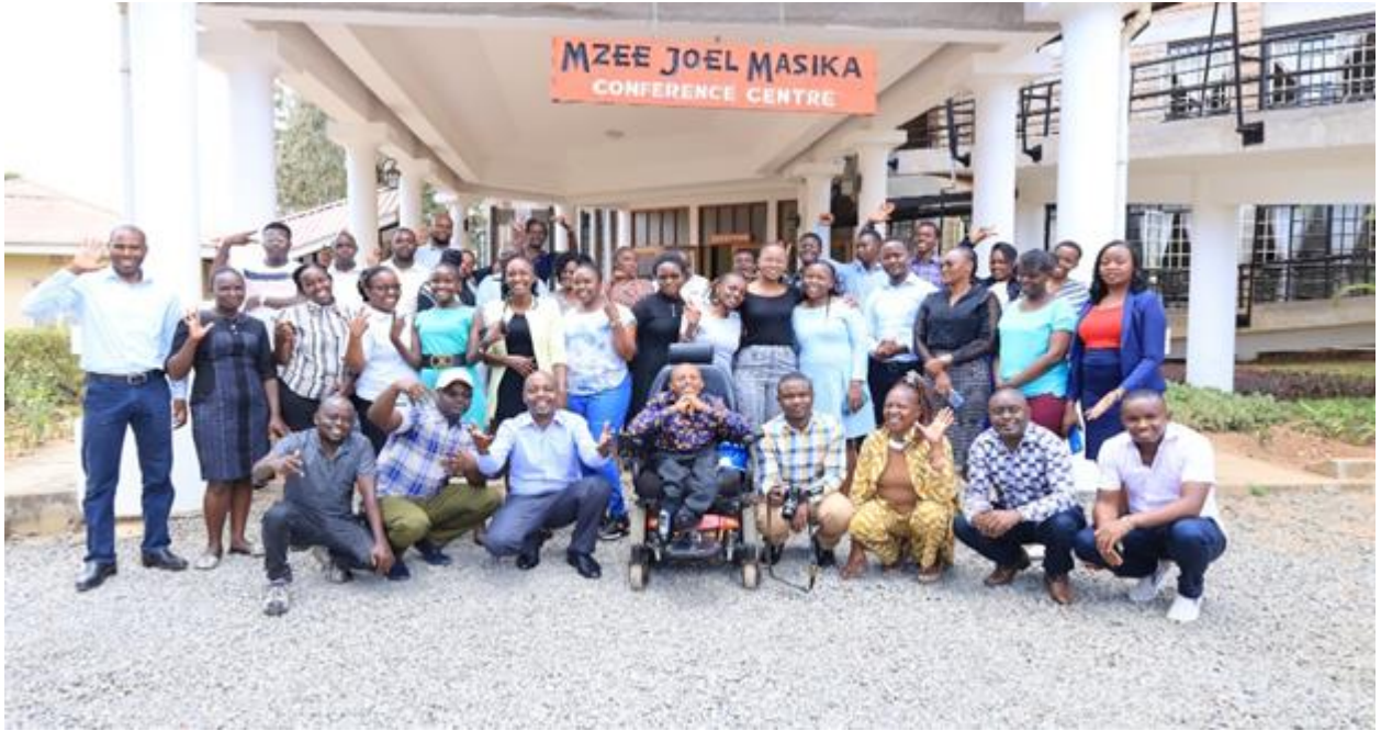
Figure 10: Non state Actors engagement forum held on 20th March, 2023 at Kusyombunguo Hotel