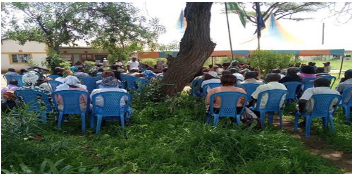
Figure 2: CIDP III public participation, Kathonzweni and Ukia Wards, 19th Dec, 2022