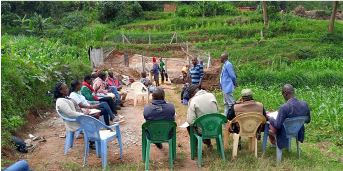
Figure 3: Joint Inspection Meeting for Kwa Kithue Wetland Protection Project, Mbooni Ward