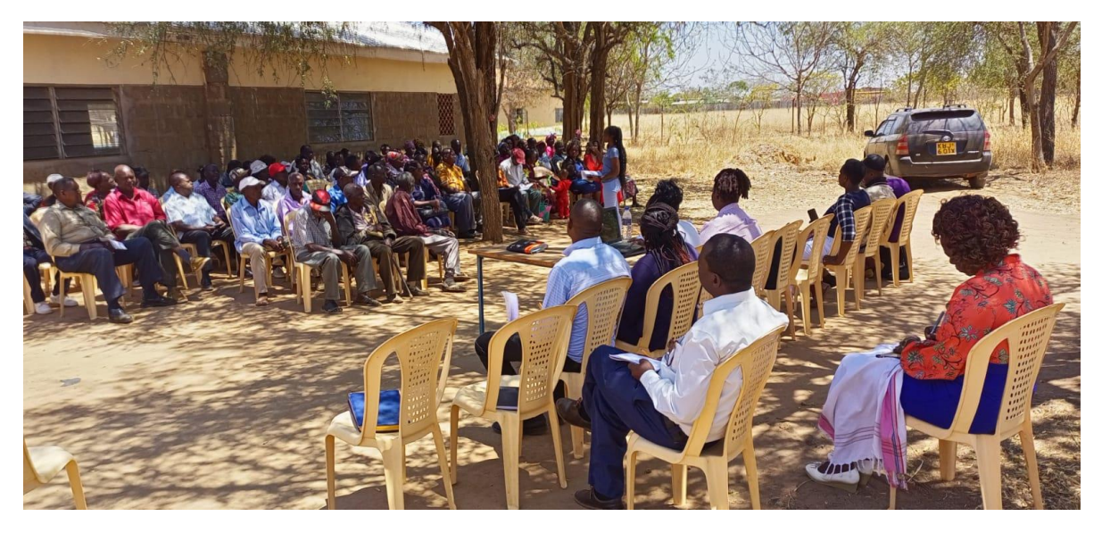
Figure 2:Kithuki subward, Kitise/Kithuki Ward ADP PP Forum