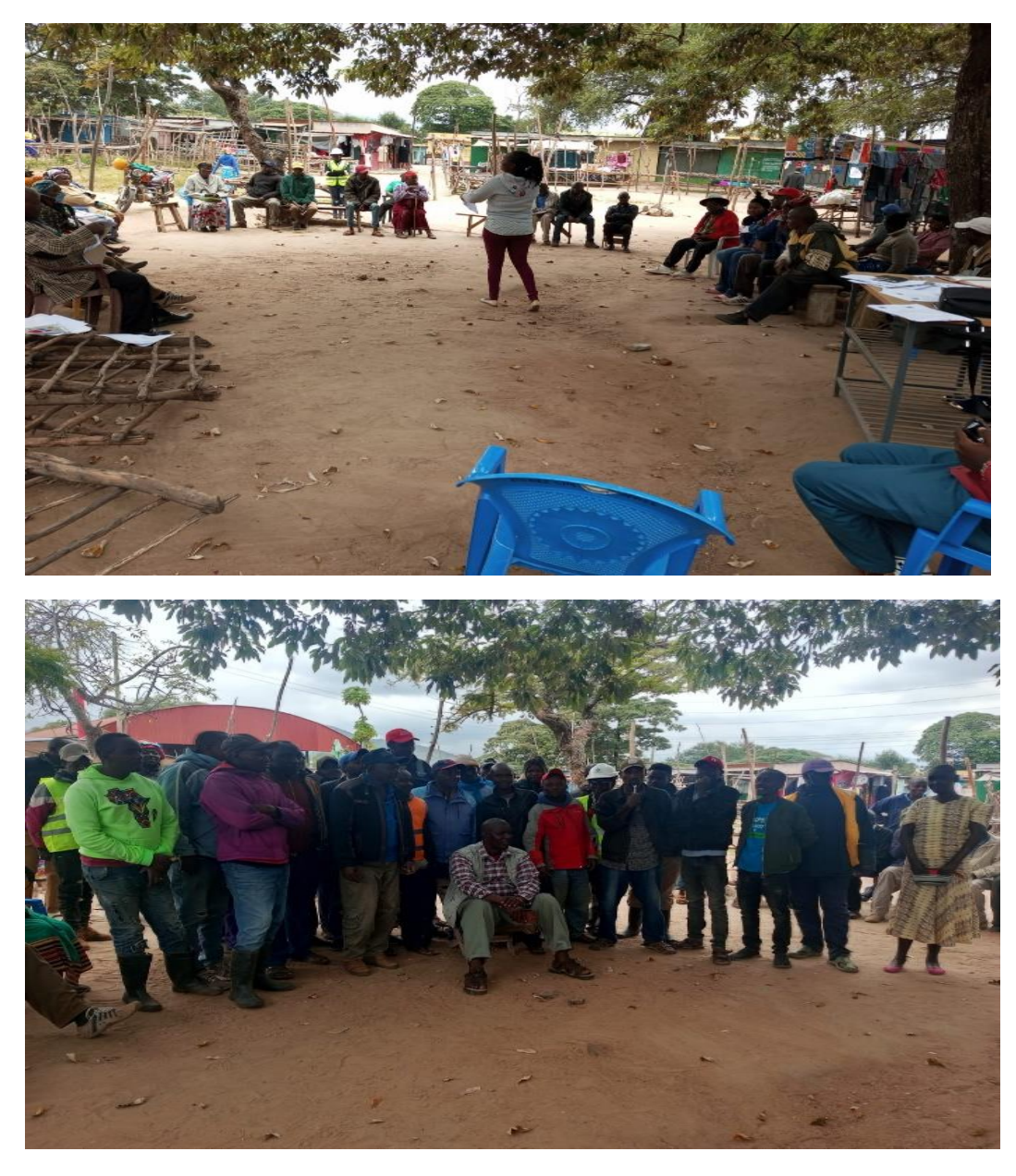
Election of sector committee members underway in Kasikeu Market. Area MCA in attendance.