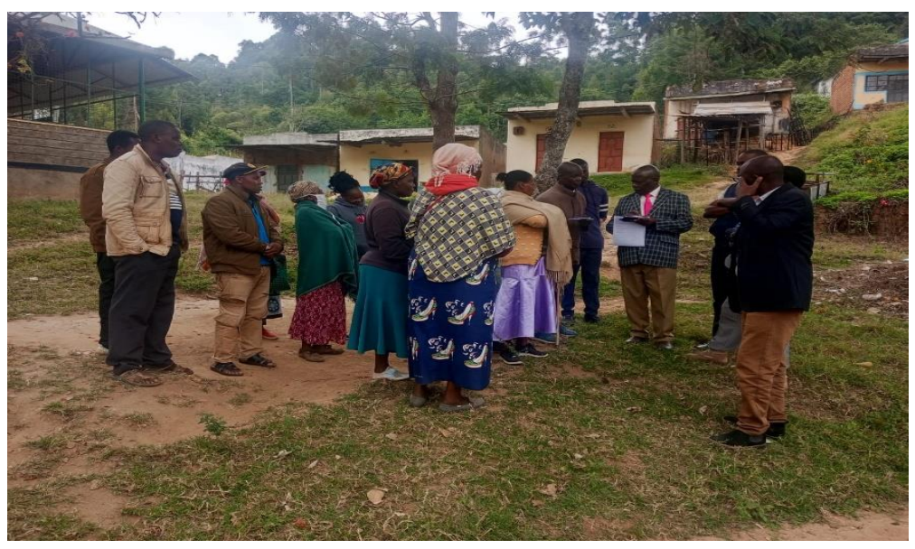
A sector in kithumani market during election of their committee members