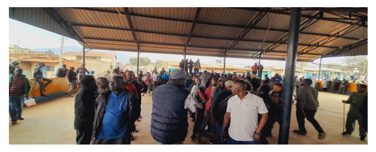
Jua kali sector members in sultan Hamud queue to elect their sector chairperson.