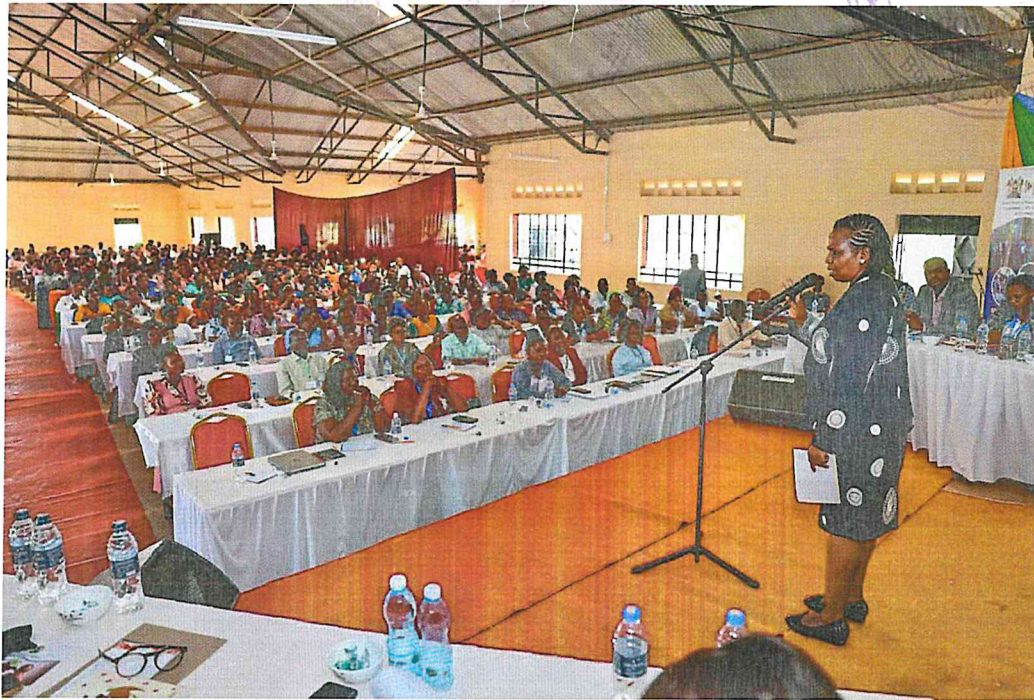
H.E the Deputy Governor giving her opening remarks