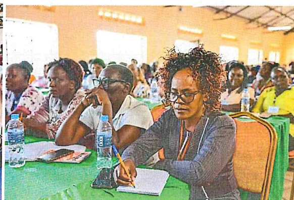
During the training sessions