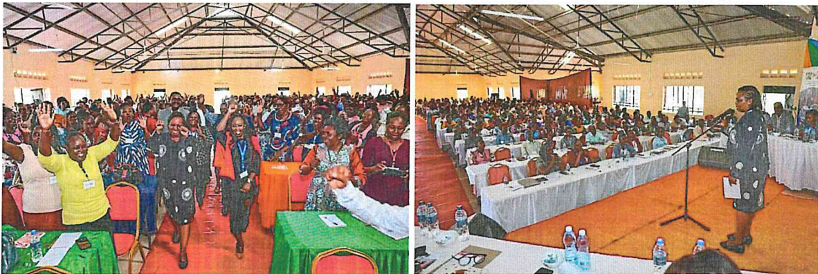
During the launch of the training by H.E the Deputy Governnor at Kibwezi Teachers College

This report presents a detailed overview of the training objectives, methodology, participants, key outcomes, and proposed areas for future collaboration and support