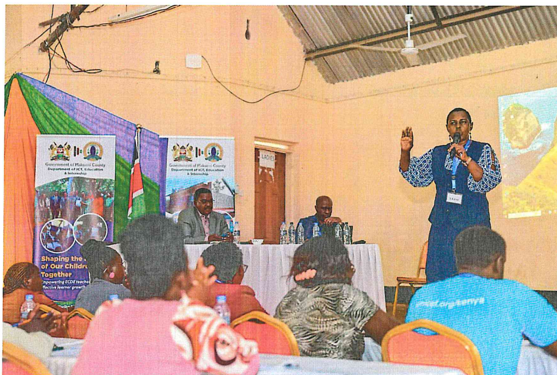
County assembly education committee